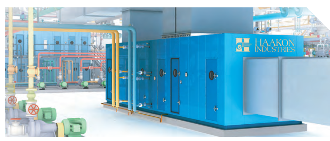
Mechanical room model developed by REVIT showing custom Haakon air handling and heat recovery units.

Haakon Industries is proud of their best-in-class status in delivering accurate